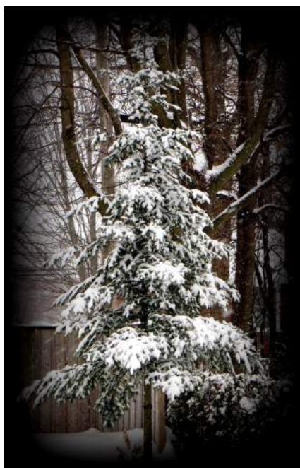
13. A Winter Garden Anita Clifford