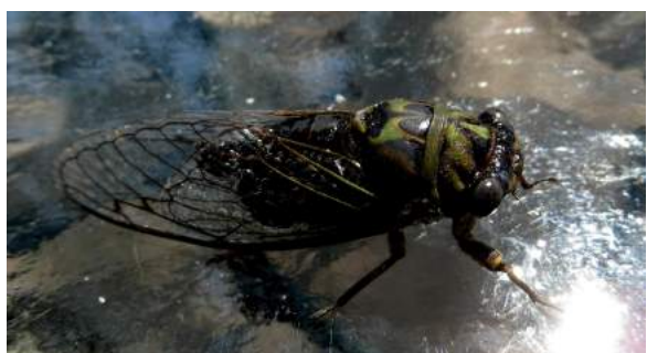
6. Small Wonders Anita Clifford