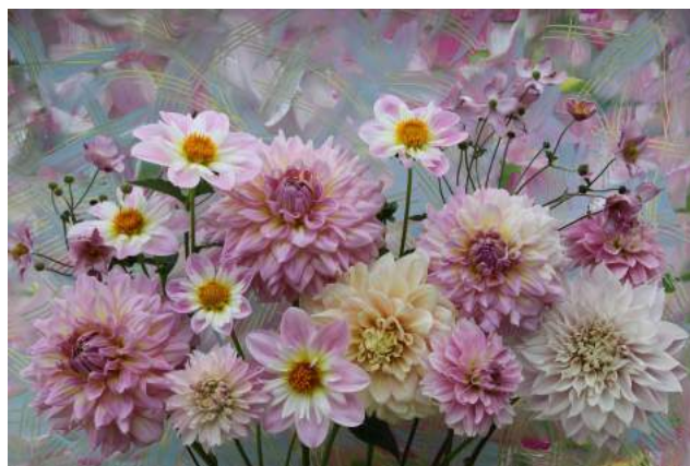
7. Best Blooms Anita Clifford