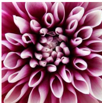
10. Close Up View Anita Clifford