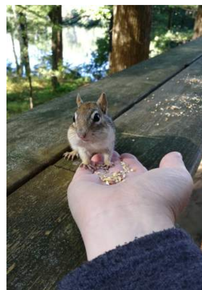
9. Wild Visitors Jen Bird